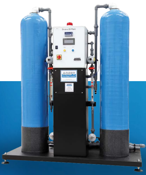
Di-on-x Automatic Multivalve Water Deioniser