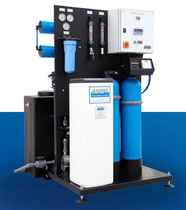
ECO RO 100-400Ltr/Hr

For further information on ADEPT Pure Water Ltd's products and services please call 01933 677181.